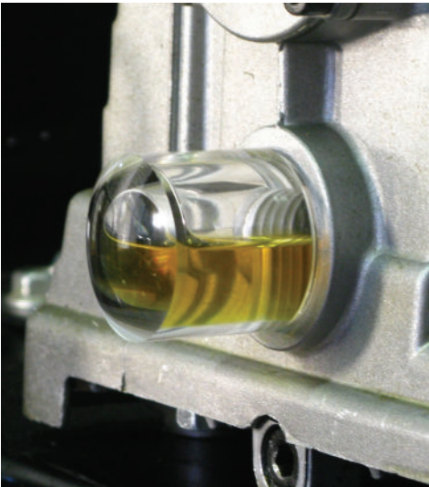
Figure 1: A 3D sight glass is much easier to read than conventional flat sight gauges

As a scientist by training and an engineer at heart, reliability engineering is a fascinating subject, replete with neat technologies, like vibration analysis, ultrasound, ferrography and oil analysis. To the geeks among us, there's nothing more magical than trending bearing defect frequencies, recording decibel readings, observing severe sliding wear particles on a microscope slide, or interpreting acid numbers.