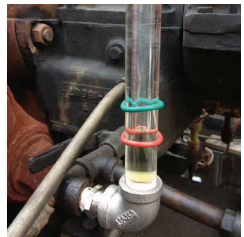
Figure 2: Column level gauges are a great way to quickly and simply check oil level, but any level gauge should be marked with the oil level when the machine is running (red) and shut down (green)

Oil level plugs also tend to be less than effective. In most plants, operators and mechanics simply do not have the time or motivation to remove a plug and check for oil on every piece of equipment. Furthermore, having the machine in operation impacts the accuracy of the level check.