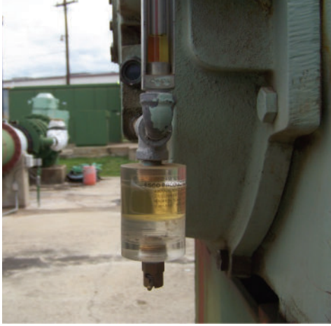
Figure 3: Installed at the lowest point on a wet sump, a BS&W bowl is an excellent way to observe free or emulsified water in oil

A much better option for when the housing does not have a sight glass port at oil level is to use an external level gauge. With a properly installed level gauge, checking the oil level takes a matter of seconds and is much more likely to actually be done regularly. Any liquid level gauge should be marked with level markers, as shown in Figure 2, showing the correct level when the machine is running and when it's down.