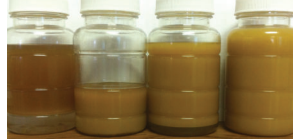
Figure 5: Simple field demulsibility tests can be very insightful in diagnosing the source of clarity problems within an oil sample

In watching NFL football, fans often celebrate the quarterback, running back or wide receiver, believing these stars of the game are the keys to winning. Just as important—and some may say even more important—are the offensive and defensive lines because without basic blocking and tackling, the stars can't do their jobs.