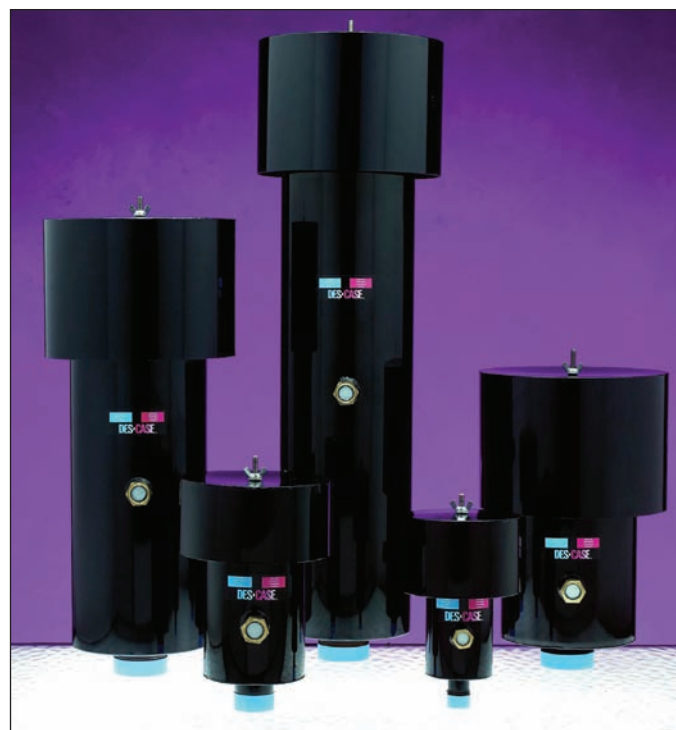
CS-20 CS-6 CS-30 CS-4 CS-10 (not shown CS-40)