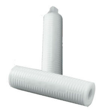
Figure 1: Memtrex PC Filters