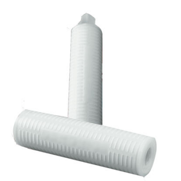
Figure 1: Memtrex MP-S Pleated Filters