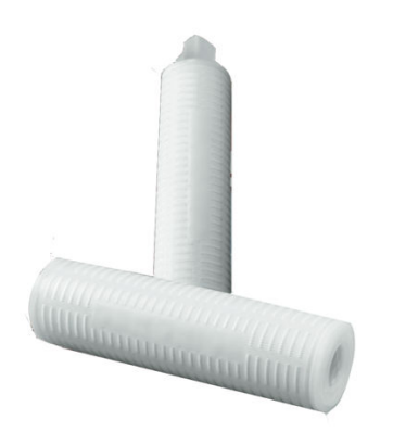
Figure 1: Memtrex MP-E (MMP-E) filters