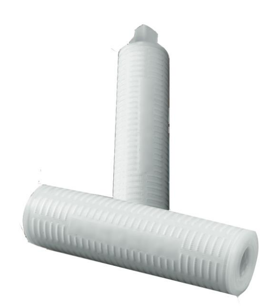
Figure 1: Flotrex GF Filters